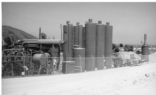
FIG. 5. Methane-purification pressure-swing adsorption unit, NRG Company, Palos Verde Landfill, Los Angeles, CA [Reproduced with permission from ref. 106 (Copyright 1997, AIMAT)].

Drinking Water. In the late 1970s, a 1-MGD (million gallons per day) water-reuse process that used clinoptilolite cation-exchange columns went on stream in Denver, CO, (Fig. 4) and brought the \text{NH}_4^+ content of sewage effluent down to potable standards ( <1 ppm; refs. 20–22). Based on Sims and coworkers' (23, 24) earlier finding that nitrification of sewage sludge was enhanced by the presence of clinoptilolite, a clinoptilolite-amended slow-sand filtration process for drinking water for the city of Logan, UT, was evaluated. By adding a layer of crushed zeolite, the filtration rate tripled, with no deleterious effects. At Buki Island, upstream from Budapest, clinoptilolite filtration reduced the \text{NH}_3 content of drinking water from 15–22 ppm to <2 ppm (25, 26). Clinoptilolite beds are used regularly to upgrade river water to potable standards at Ryazan and other localities in Russia and at Uzhgorod, Ukraine (27, 28).