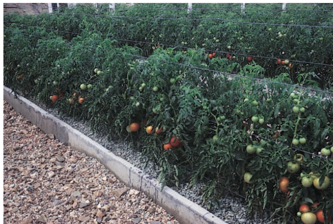
FIG. 6. Tomatoes grown zeoponically in Havana, Cuba [Reproduced with permission from ref. 106 (Copyright 1997, AIMAT)].

These reactions await serious physiological and biochemical examination.