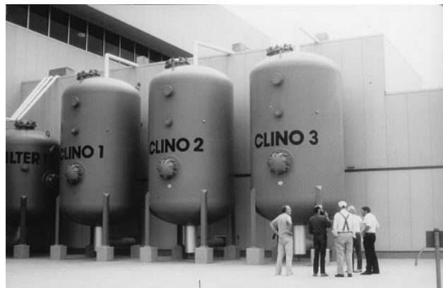
FIG. 4. Clinoptilolite-filled columns at a Denver, CO, water-purification plant [Reproduced with permission from ref. 106 (Copyright 1997, AIMAT)].

clinoptilolite for extracting \text{NH}_4^+ from municipal and agricultural waste streams. The clinoptilolite exchange process at the Tahoe-Truckee (Truckee, CA) sewage treatment plant removes >97\% of the \text{NH}_4^+ from tertiary effluent (15). Hundreds of papers have dealt with wastewater treatment by natural zeolites. Adding powdered clinoptilolite to sewage before aeration increased \text{O}_2 -consumption and sedimentation, resulting in a sludge that can be more easily dewatered and, hence, used as a fertilizer (16). Nitrification of sludge is accelerated by the use of clinoptilolite, which selectively exchanges \text{NH}_4^+ from wastewater and provides an ideal growth medium for nitrifying bacteria, which then oxidize \text{NH}_4^+ to nitrate (17–19). Liberti et al. (19) described a nutrient-removal process called RIM-NUT that uses the selective exchange by clinoptilolite and an organic resin to remove \text{N}_2 and P from sewage effluent.